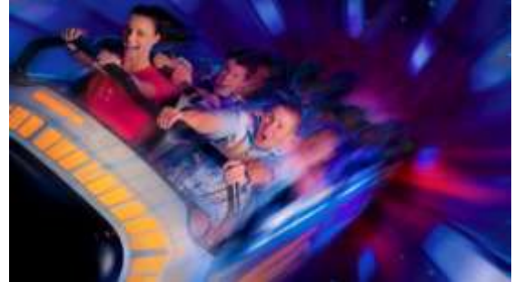
Enjoy the Parks