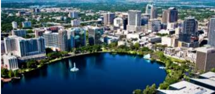
Aerial view of Down Town Orlando