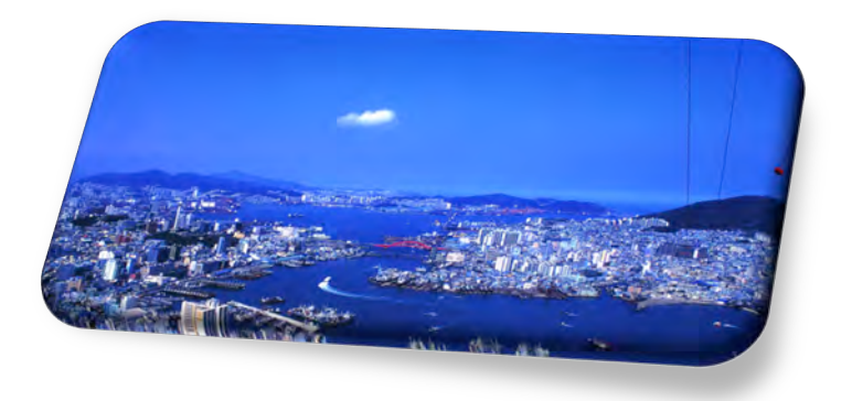
(Landscape of Busan Metropolis)